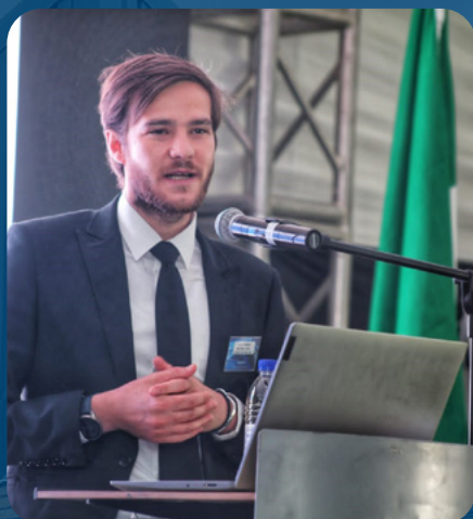
Executive Mayor of Mogale City Tyrone Gray