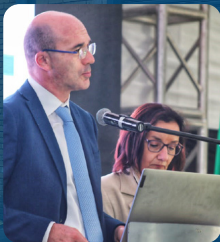
Luca Vecchi Mayor of Reggio Emilia