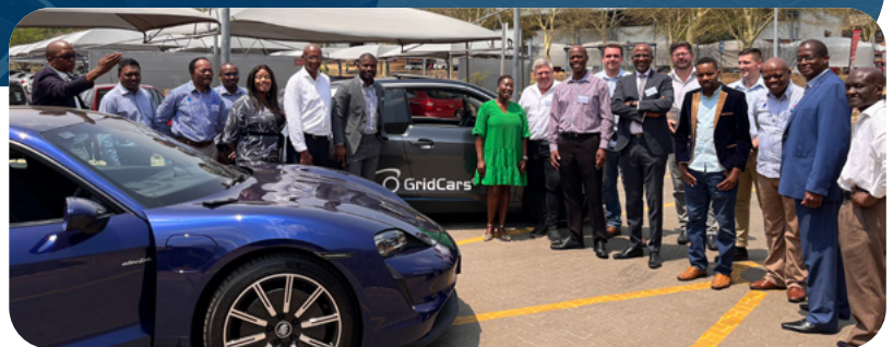
AIDC, GridCars and Lebone Renewables delegates available at the ceremony

Automotive Industry Development Centre (AIDC), GridCars and Lebone Renewables signed a Memorandum of Agreement on Thursday, 13 October 2022 at AIDC offices in Rosslyn. With similar interests in Electric Vehicles (EV), the parties signed the agreement with a mandate and wish to co-operate in areas of mutual interests.