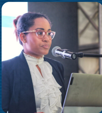
MEC Tasmeen Motara