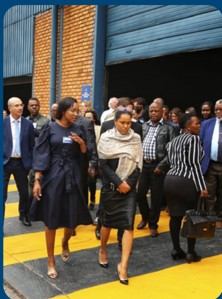
Tour of the Chamdor Automotive Hub